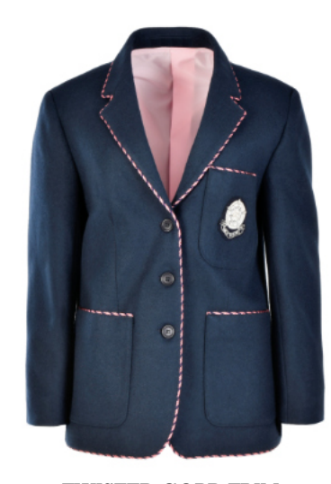
TWISTED CORD TRIM

Can be added to blazer/jacket collar, lapel, main body, sleeves, top of patch pockets. Various widths available and many colours