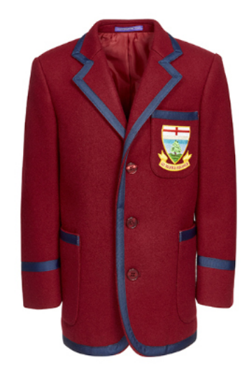
PETERSHAM BRAID TRIM

Can be added to blazer/jacket collar, lapel, main body, sleeves, top of patch pockets. Various widths available and many colours