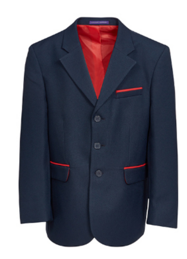
WELT AND JETTED POCKET TRIM

Can be added to blazer/jacket collar, lapel, main body, sleeves, top of patch pockets. Various widths available and many colours