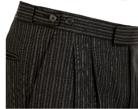
EXTERNAL TUNNEL ADJUSTER