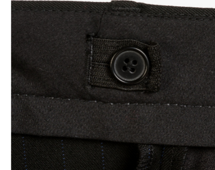
INTERNAL TUNNEL ADJUSTER