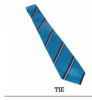
Ties available in many colours, widths and lengths