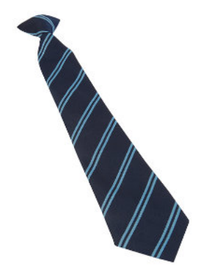
TIE CLIP ON